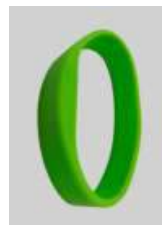
Silicone Wristband NXP MIFARE®