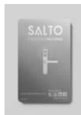
Key Card NXP MIFARE®